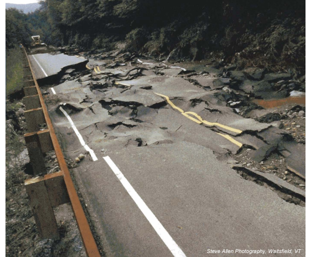
Road damage as a result of flash flooding.

When you approach a flooded road, TURN AROUND, DON'T DROWN!